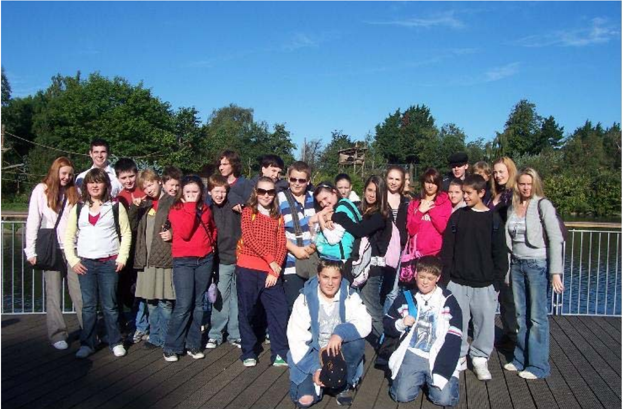
Group photo: 1st Years, mentors and teachers on our trip to Dublin Zoo